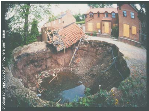
Geophysical surveys can detect hazardous ground conditions before they become a problem

One of the key considerations for property developments in Limestone or Chalk environments is the presence of sub-surface solution features and voids. The need to fully characterise unstable ground for foundation design is a significant factor for both the valuation, construction and post-development phase.